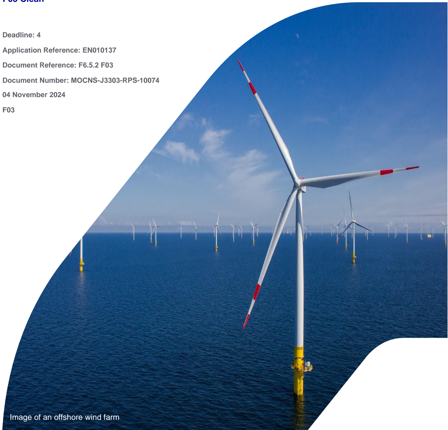
Image of an offshore wind farm